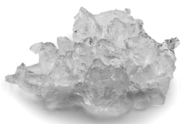
MF 36 Flake ice Residual water content 25%